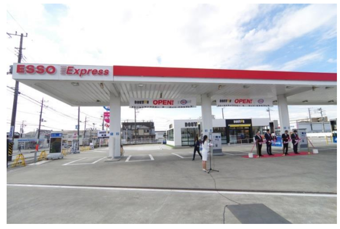
Opening ceremony by the two companies on December 15, 2016

At our Doutor Coffee Shop, we welcome customers with fresh, delicious coffee and a generous menu of items such as Milano sandwiches, cakes and sweets, made with carefully selected ingredients. Our drive-thru order system features a digital signage touch panel, the first in the cafe industry. While this system enables customers to order by voice, it also appeals to smartphone users with its operation by tapping, thereby contributing to increased opportunities for use by a variety of customers.